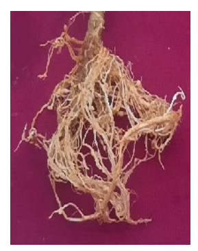
(a) Chitosan treated plant root